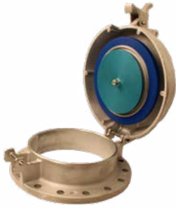
MODEL 12-TH THIEF HATCH