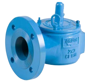
SERIES 1360A VACUUM RELIEF VALVE (Side Mount)