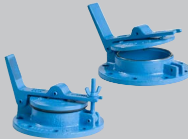
MODELS 6000/6100 GAUGE HATCH