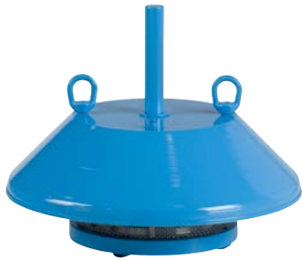
SERIES 2300A PRESSURE RELIEF VALVE