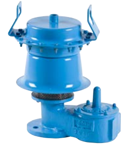
SERIES 1500 AIR OPERATED PRESSURE/VACUUM RELIEF VALVE