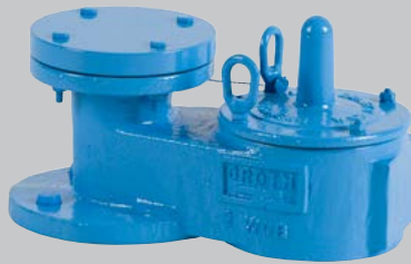
SERIES 1300A VACUUM RELIEF VALVE